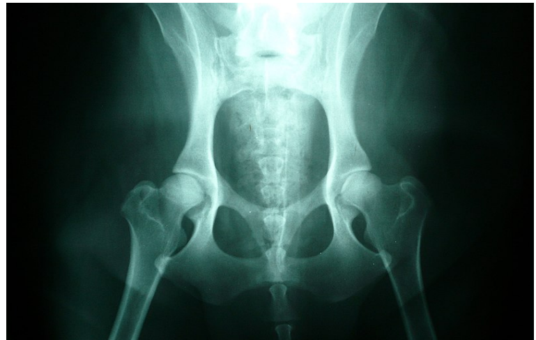
Radiograph of normal dog hips. Joel Mills 2007.