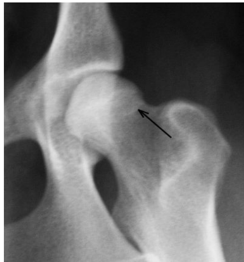
Radiograph of left canine hip with hip dysplasia. Uwe Gille 2005.